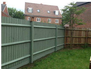
Great picture to see contrast between painted + unpainted fence