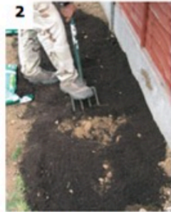
2 Prepare ground by digging to a depth of at least 20cm (8"). Add soil conditioner if required.