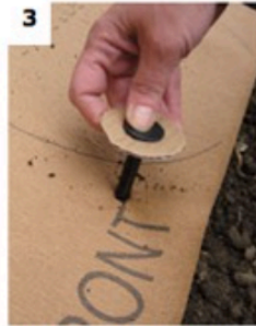
3 Roll out paper plan and peg into ground (pegs supplied).