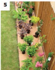
5 All plants are supplied and have a designated position to ensure correct