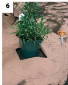
6 Remove pot and plant into ground through holes cut into paper.