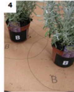
4 Place pre-numbered plants on their indicated positions.