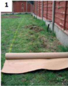
1 Mark out border width on the ground and remove top layer of turf.

I like this planting idea for surprising weed seeds and seeing the plants better as you plant them.